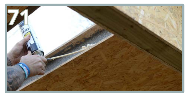
Xtend2.5 only consists of 2 roof panels. This step does not apply to your build.