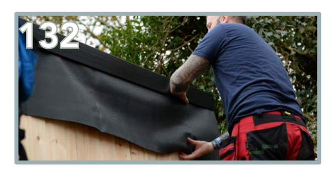
Slot the plastic trim on the top edge, flush to the back.