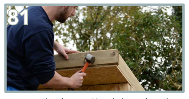
Use expanding foam and knock the roof panel cap (AQ) into place. Repeat the same process. Ensure they are flush to all edges.