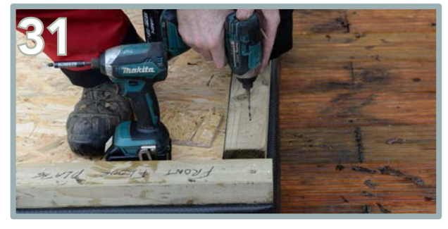
Repeat the process on the other side floor plate (AK) and screw into place.