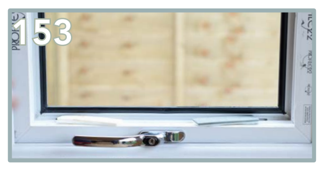
Apply packers with the adhesive silicone. The glass should be packed at diagonally opposing corners to hold the casement square, using the toe and heel process.