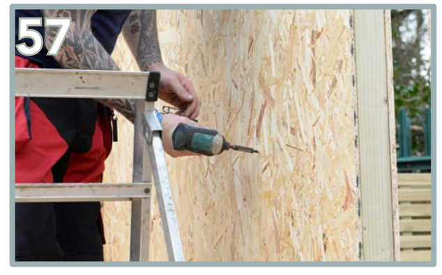
Internally position the screws each side of the adjoining split line. Use 5 \times 35 mm screws for each side of adjoining panels with the spline panel inside from top to bottom. Repeat this process for every adjoining panel.