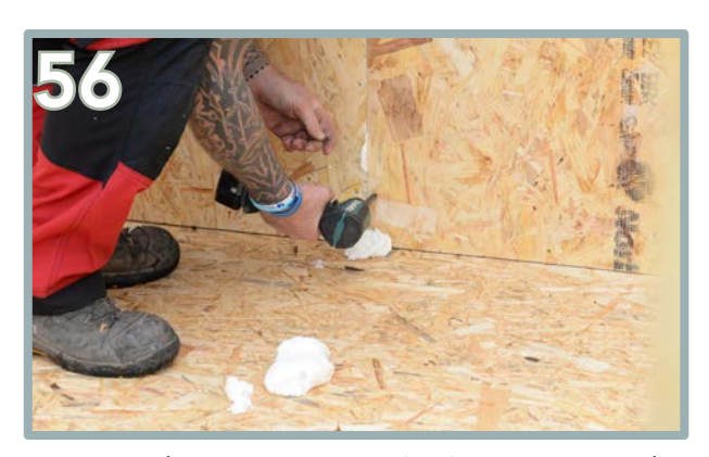
Repeat the process, using 3 x 35mm per panel internally.