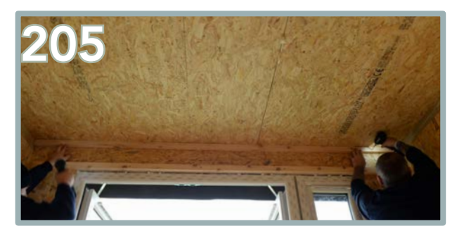
Apply one batten above the door opening, flush to the edge opening. Apply the top batten flush to the top. Use 5 x 80mm screws per batten.