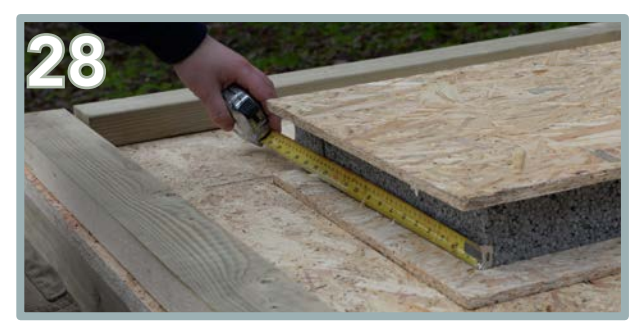
Pre-drill and use 4 x 125mm screws for the front floor plate (AL) Apply 2 x 125mm screws per end. Measure out your front panel (O) and ensure your front panel is placed flush to the edge.