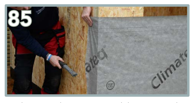
Then warp the excess around the corner and staple the starting point into place.