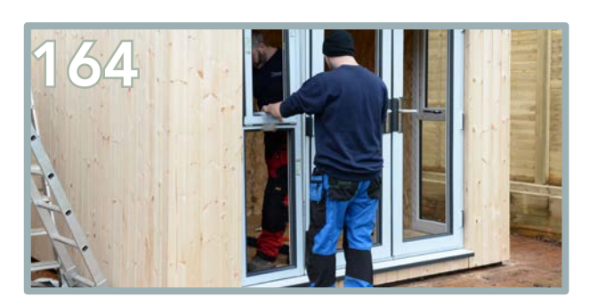
Insert the window frame into the left hand side of the double doors. The metal cap will slot into place.