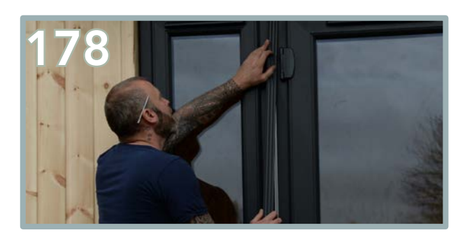
For the adjoining frames, attach the strip provided with the metal capping. This will clip into the fixed metal capping. To further secure, you can also add glue to the strip.