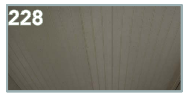
The final result is shown above.