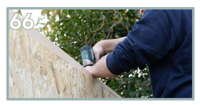
Use 2 x 35mm screws to secure the component within the thinner section. Repeat this process on the opposite side.