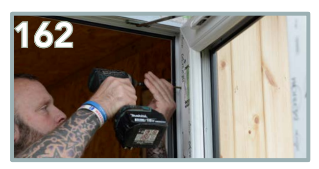
These should be drilled 150mm from the top and bottom corners and 300mm from the 150mm points with the 112mm screws.