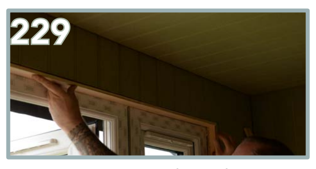
Start to apply the internal framing for the door. This is the same process as the external framing application. Start at the top, ensuring the board is flush to the edge.