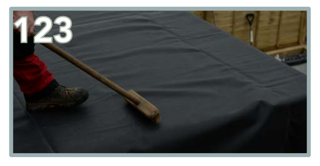
Roll the EPDM half way on to the glue. Use a brush/broom to create an even and flatter finish. You need to act quick once the glue has been applied.