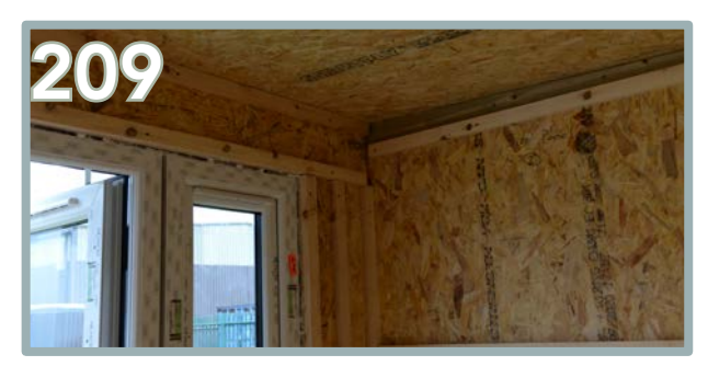
Use 5 x 80mm screws for each batten. The battens on the left hand side will not be aligned to the front batten positions.