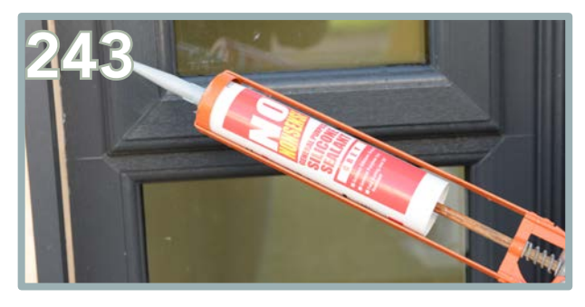
You will be provided a silicone seal for the windows and doors. The colour provided will match your windows and doors.