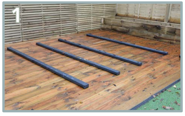
Lay the bearers down and spread them out roughly ready to position the floor panels on top.