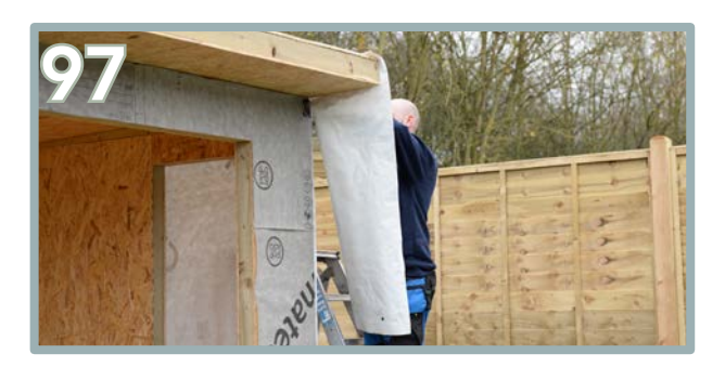
Remove the roof overhang excess.