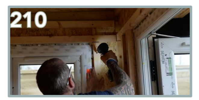
Repeat the same process for the two top battens and frame the window. Apply the 45x28x1960mm battens, one on either side using 4 x 80mm for each.