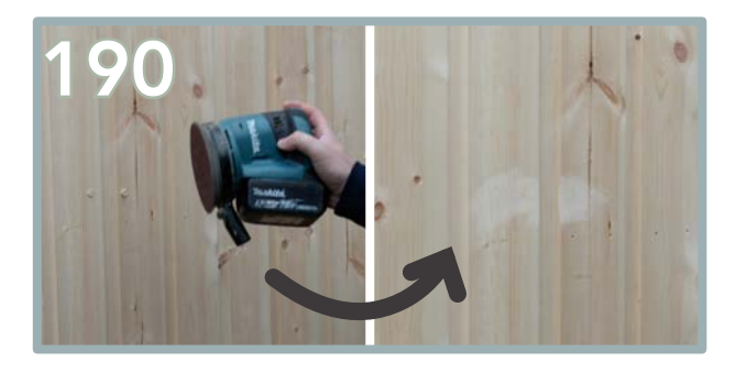
Finish with slightly cutting down and/or just sanding off any excess showing to produce a seamless finish. Repeat this process for every screw hole on the T&G panels.