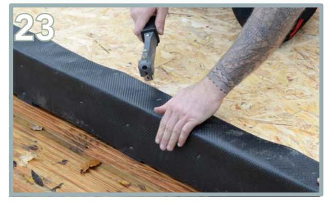
Continue folding the overhang and corners of DPC onto the OSB sheets as you make your way around and staple in place.