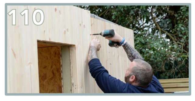
Ensure the opening of the cladding is flush around all edges to the window opening provided (BC). If not aligned properly, this will cause issues during the window installation.