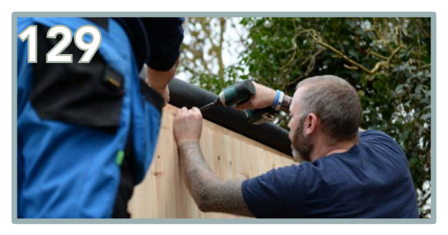
Screw into place using 2 x 80mm screws. Ensure the batten is butted up to the T&G panel and wall panel behind.