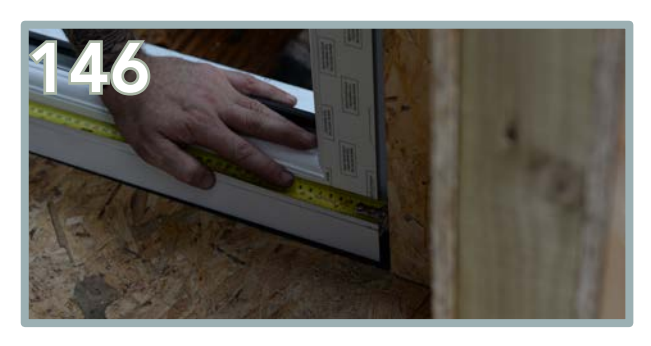
Apply adhesive silicone on to the base and carefully position the new frame into the aperture. Ensure to centralise it.