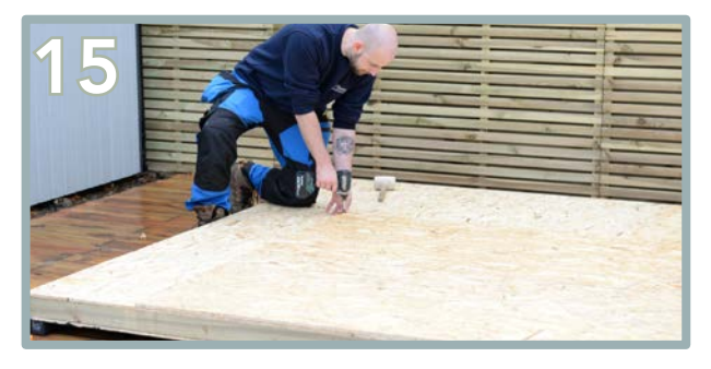
Using 35mm screws, screw 3 across the top and 5 down the sides of each OSB sheet. Screw along the edges first.