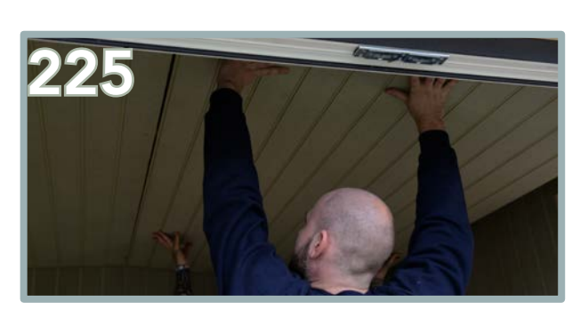
Repeat the same process. Ensure the rounded edge is butted up against the chamfered edge on the first panel.