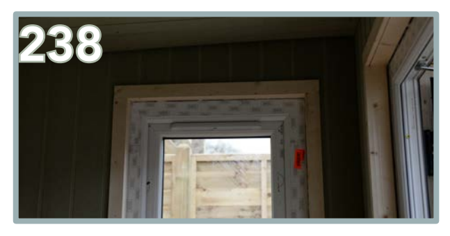
Use 5 \times 30 mm nails per side 45mm board. Finish with the top board using 4 \times 30 mm nails to secure.