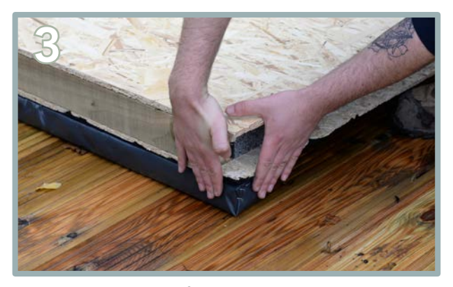
Ensure the panel is flush around the edges to the first bearer. Ensure the floor panels on the bearers are level using a spirit level as a guide.