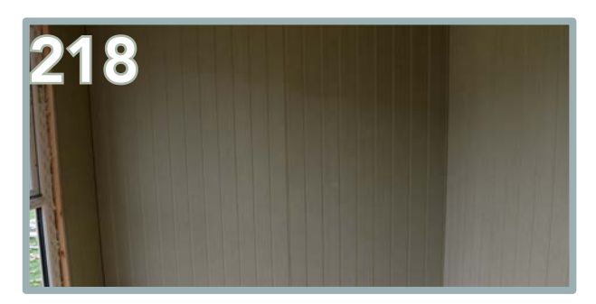
Use 4 x 50mm screws on each side and 2 x 50mm screws in the centre for both panels.