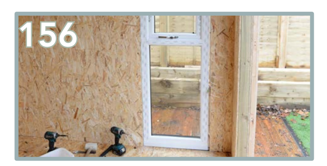
Repeat the same process for the bottom pane, ensuring it is centralised and packed properly with the toe and heel process.