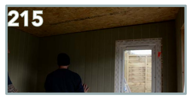
Move onto the front beaded boards. There will be two 'L' shaped pieces on either side of the door. Use 10 x 50mm screws to secure. Use 6 x 50mm screws on the top half and 4 x 50mm screws on the bottom half. Use 6 x 50mm screws for the lintel board in the middle.