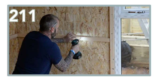
Apply the three shorter 45x28mm battens in between the window and back. These will be flush end to end and ensure they are the same height as the positioned back panels.