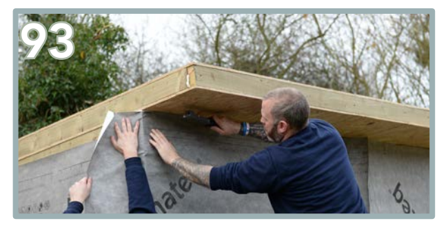
Using the excess membrane, cover the front flush up to the roof.