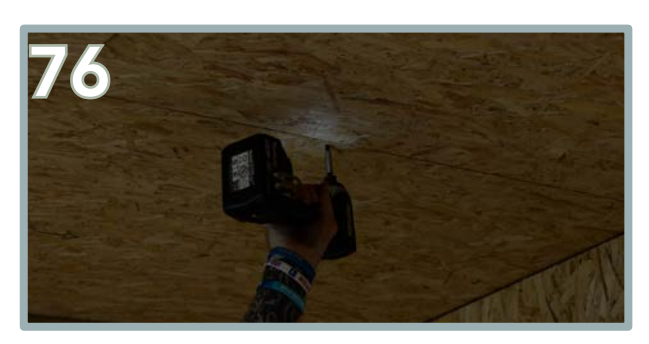
Pre-drill and screw 5 x 35mm screws, where the adjoining panels intersect.