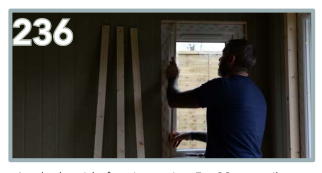
Apply the side framing, using 5 x 30mm nails per board.