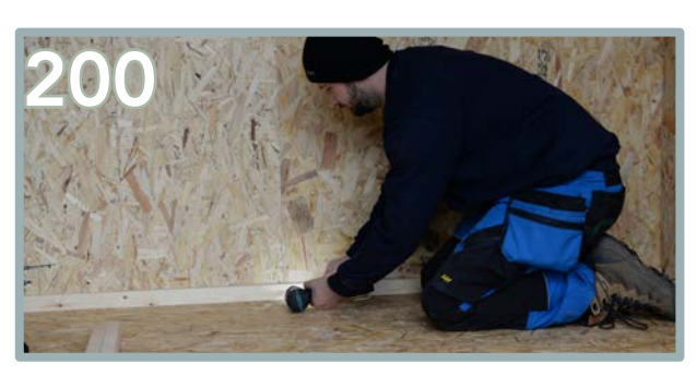
Repeat the process with the batten being flush to the bottom and end to end. Use 5 x 80mm screws along the batten at equal spaces.