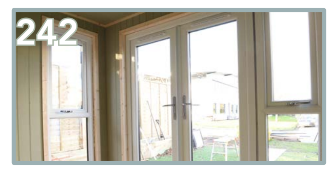
The above picture shows the final result of the windows and door.