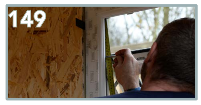
These should be drilled 150mm from the top and bottom corners and 300mm from the 150mm point at both sides. Use packers at the fixing points to avoid distortion to the frame.