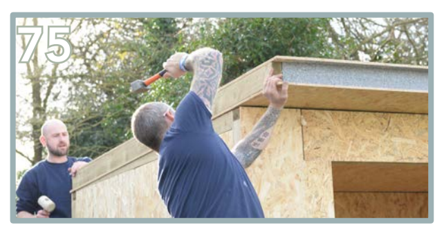
Knock further into place to allow the roof panel to be as flush as possible to the wall face.