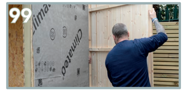
Begin applying the T&G cladding at the back (BN).