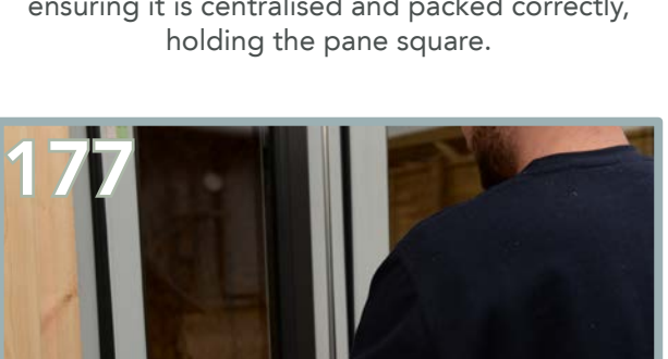
Repeat the same process for the other door and window panes, ensuring it is centralised and packed properly with the toe and heel process. Then add the window handle inside.