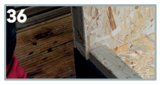
In the left hand corner, the wall panel will be flush to the edge and the floor plate as shown above.