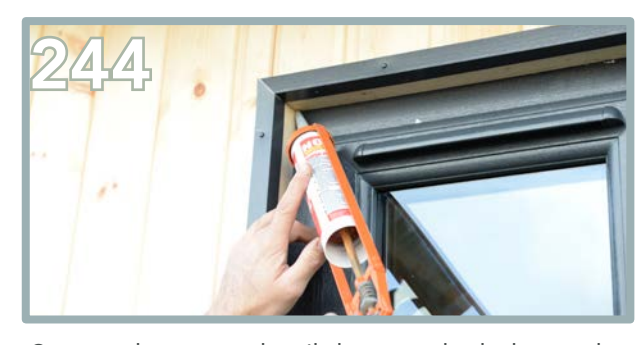
Start at the top and trail down to the ledge at the bottom. Keep the amount of silicone consistent as you trail down.