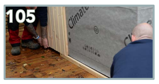
Ensure the cladded panels are 45mm off the ground. If you are using the batten as a guide, slightly lift up the secured panel to ensure it is carefully removed to prevent any damage.