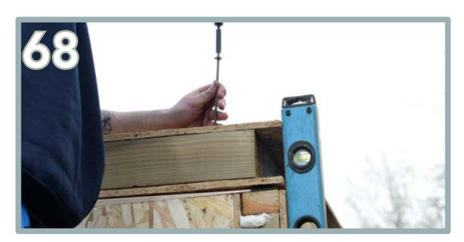
Position the back of the roof panel. Using the spirit level as a guide, the top OSB sheet on the roof panel needs to be flush to the back edge. Use 4 x 150mm screws along the edge.