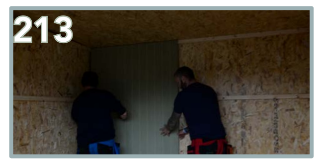
Start at the back left hand corner. Ensure the rounded edge of the panel is up against the wall. Use 4 \times 50 mm screws on each side and 2 \times 50 mm screws in the centre.