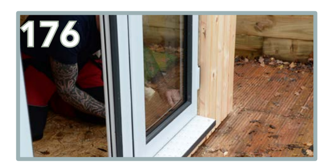
As the pane is positioned, the beading can be installed using a nylon mallet and tapped securely back into place.