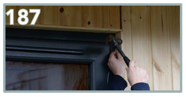
Secure into place with 5 x 30mm nails. Repeat the process for the opposite side of the door frame. Then repeat the same application around the window frame.