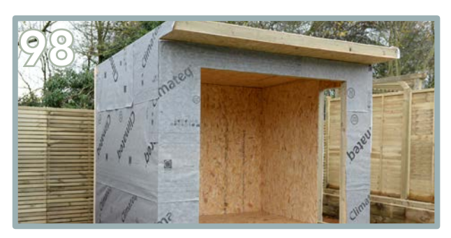
The final result is shown above. You do not need to add membrane to the canopy / the roof overhang.