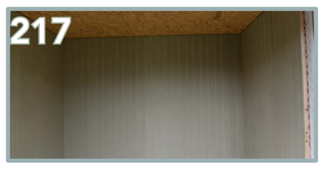
Use 10 x 50mm screws for the window panel and the trimmed side panel. Repeat the same process on the opposite side. Both of these will be the same sizes to fit into place.