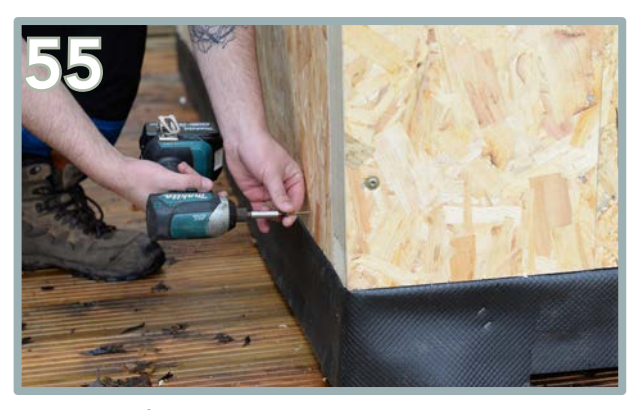
Once all of the wall panels are up, begin to secure each wall panel to the floor plate underneath. Use 3\times35 mm per panel externally.