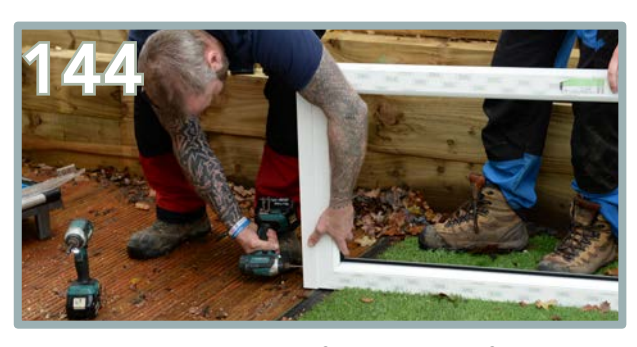
Remove any packaging from the new frame and screw the sill into the bottom of the frame. Use 2 x 50mm screws and ensure not to penetrate the inner skin of the frame.