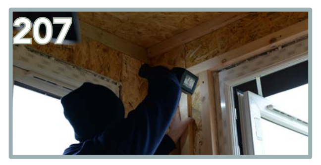
Then apply a batten in between the other two. Use 4 x 80mm screws and repeat on the opposite side of the door.