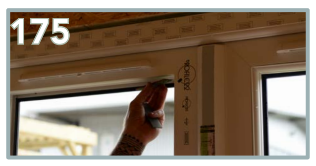
Apply silicone and stick the packers at diagonal opposing corners. Place the pane into position, ensuring it is centralised and packed correctly, holding the pane square.