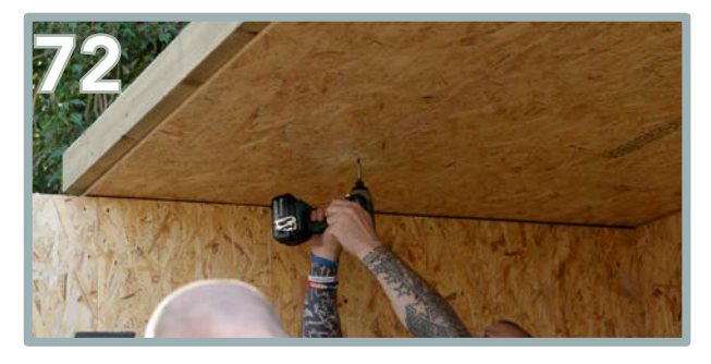
Xtend2.5 only consists of 2 roof panels. This step does not apply to your build.