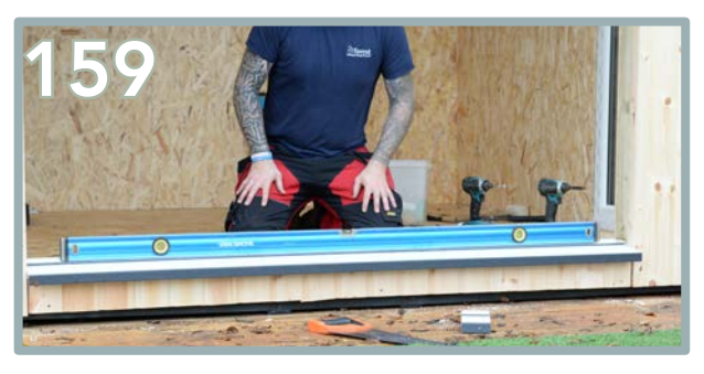
Place the ledge onto the silicone. Ensure it is level and the back edge meets the first edge of the back OSB sheet (The same positioning as the window).