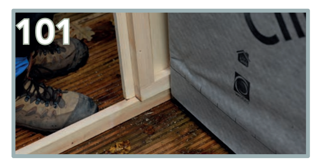
Repeat the same process for the second back panel (BM). Softly knock the second back panel into the first, so the T&G interlocks the panels together. Use a rubber mallet for a softer application.