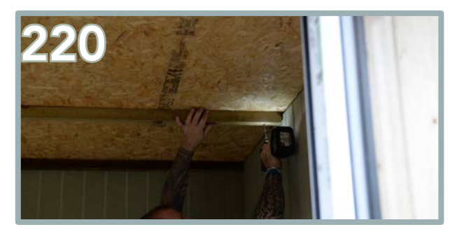
Measure and mark out equal spacing for the two central battens. Position the first batten and secure with 5 \times 80 mm screws.