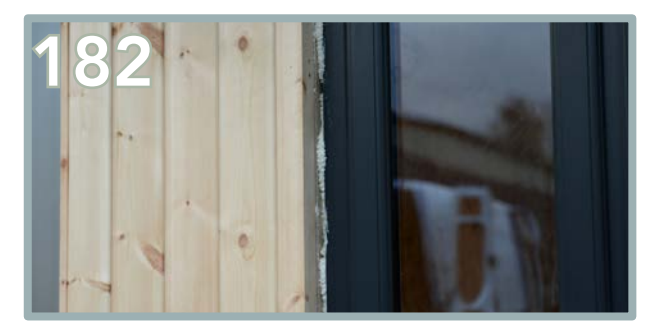
The expanding foam will be tack free in about 20 minutes. It can be cut back after twelve hours and will be fully cured in 12 -24 hours.

Need some extra help with the window and door sections? Access our 'how to' video on our website at forestgarden.co.uk