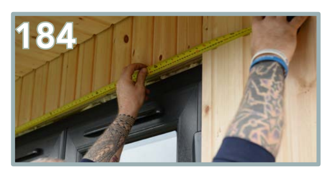
If any of the boards are slightly oversized, you will need to measure out your required length. Start with the top board.