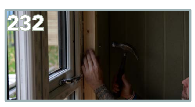
Apply the 45mm boards on top of beaded panel. Ensure this is flush to the inner framing. Use 5 x 30mm nails to secure. Repeat this process on the opposite side.