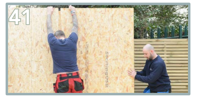
Add expanding foam into the inner side groove and into the bottom groove of the second back panel (H) and knock into place to complete the back wall.