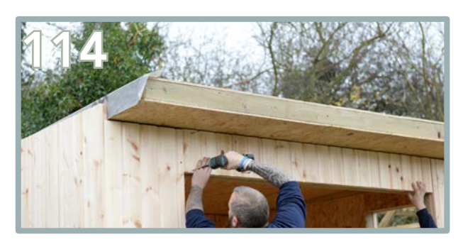
Apply the lintel panel (BL). This will fit in between the front panels. Use 6 x 80mm screws. Make sure to drill through the battens beneath.