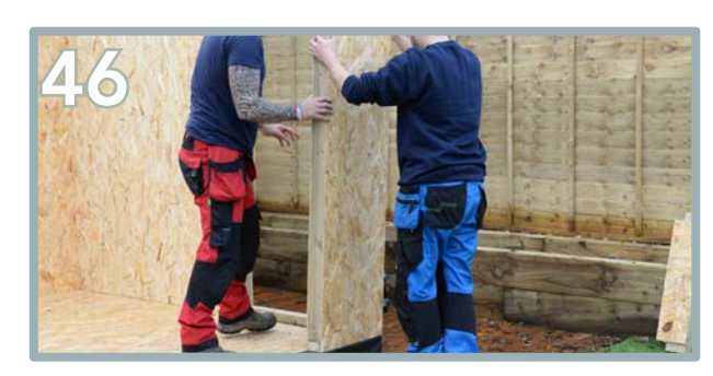
Apply the front wall panel (O) and butt up against the front side wall panel just secured. Ensure all edges are flush.