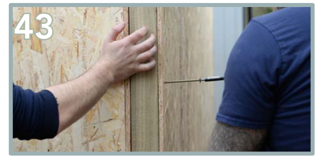
Pre-drill and screw through the back panel (H) into the side wall panel (G) using 3 x 150mm screws (top, middle and bottom).