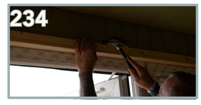
Fix into place using 6 x 30mm nails.