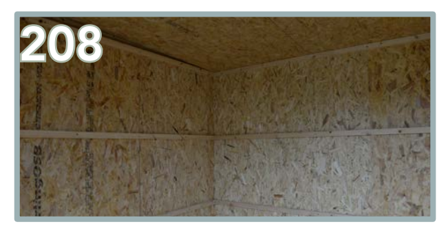
On the left hand side, apply the 45x28mm battens in between the front and back battens. These will flush end to end. Position each batten at the same height as the back.