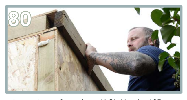
Insert the roof panel cap (AQ). Use 4\times125 mm screws through the panel cap and into the wall panel. Use 3\times35 mm screws, in between the 125mm screws to fully secure.