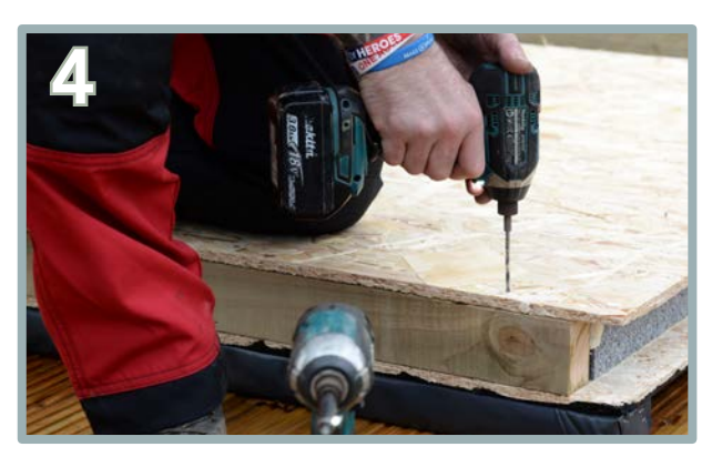
Pre-drill for every process before securing with screws. Pre-drill 5 holes along the edge of the first floor panel. Do not screw in the other side at the moment.