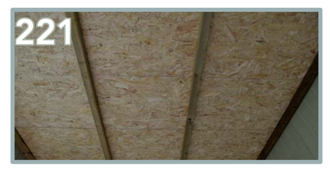
Repeat the process for the last roof batten.