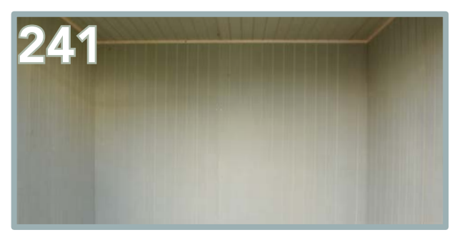
Use 5 x 30mm nails for the roof trims on each side. The final result from the back.