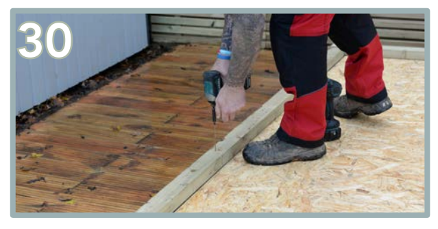
Your side floor plates (AK) will fit in between your front and back plates. Ensure 11mm from the outer edge and 11mm at each end. Once happy with the position, pre-drill and screw into place using 4 x 125mm screws.