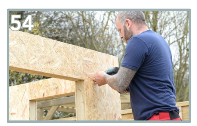
Position the screws on the Lintels OSB and screw into the wall batten behind. Secure into place using 4 x 35mm screws internally and externally, 2 x 35mm screws each side of the lintel insert.