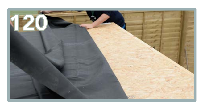
Fold the EPDM back to half way across the roof - we recommend two people for this. Be careful when moving on and around the roof to prevent any possible injuries.