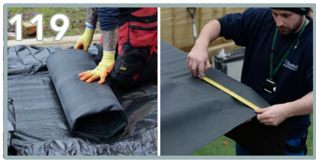
Unwrap the EPDM out onto the floor first, then measure out on the roof to ensure an equal overhang around all edges.