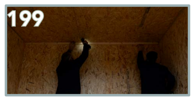
Begin at the back and position the 45 \times 28 \text{mm} batten flush to the top. This will be the correct length to fit in the space end to end. Use 5 \times 80 \text{mm} screws along the batten.