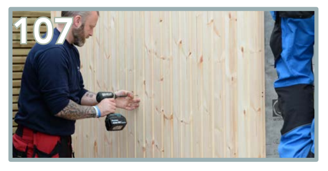
Using 3 \times 80mm screws, screw the one side into place.