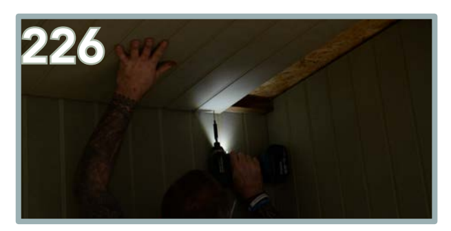
Use 4 \times 50 mm screws on each side and 2 \times 50 mm screws in the centre for both panels.