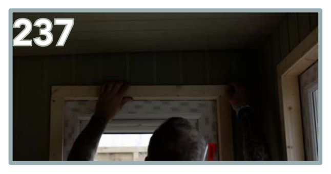
Apply the overlapping framing. Ensure flush around all edges and trim if necessary.