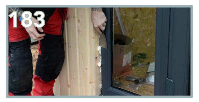
Remove all excess expanding foam around the window and door frames. Preferably it is better to wait for the expanding foam to cure before removing for easier removal.