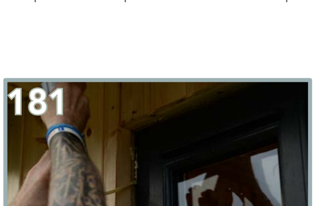
Repeat the application of the expanding foam around the front window and door frame.