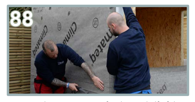
Repeat the same process for the top half of the building. Ensure the starting point is flush to the top of the back wall panels.