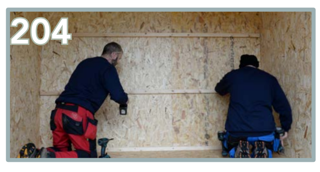
Using 5 \times 80 mm screws to secure in place.