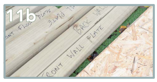
The components provided will be labelled accordingly to the components list, at the back of this guide book.