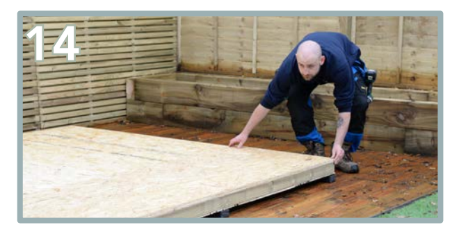
Apply OSB floor sheets (AG) on top of the SIPS panels one at a time. Ensure they are flush to all edges and screw into the corners to keep secure.