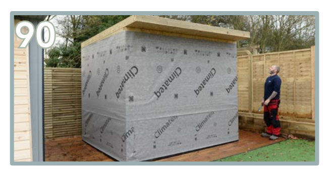
There will be a slight gap at the front and on the sides due to the angle of the roof.