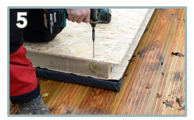
Using 125mm screws, screw through the floor panel into the floor bearer beneath. Repeat the process for the 4 other screws. Ensure each screw is countersunk.