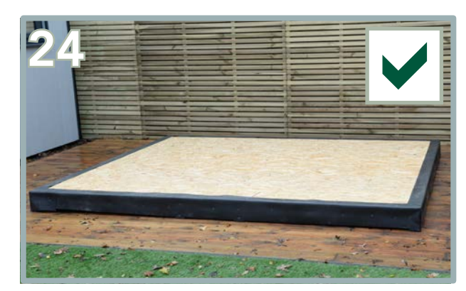
The final result is shown above.