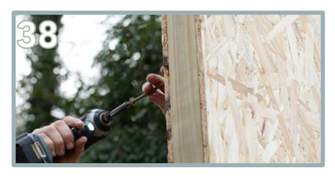
Pre-drill and using the star drill bit provided in your fixing box, screw through the back into the side wall panel using 3 x 150mm screws (top, middle and bottom).