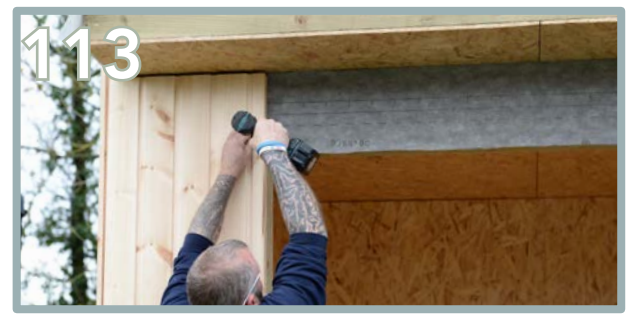
Repeat the process for the other front panel (AU).