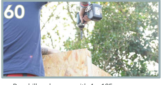
Pre-drill and secure with 4 x 125mm screws. Repeat the same process for the back wall plate (AL).