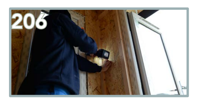
Using the 45x28x1960mm battens, apply one on each side of the door opening with 4 \times 80 mm screws. Then apply another two, with one in each corner, with 4 \times 80 mm screws.