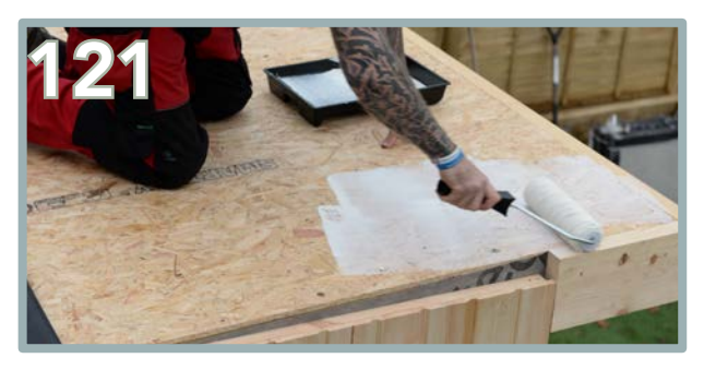
Pour the glue into a paint tray and use a roller for easier application.