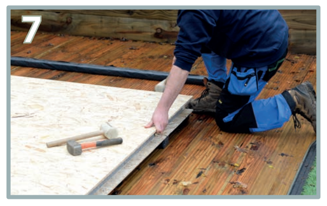
Using a rubber mallet, knock the second panel into the first for a tight fit.