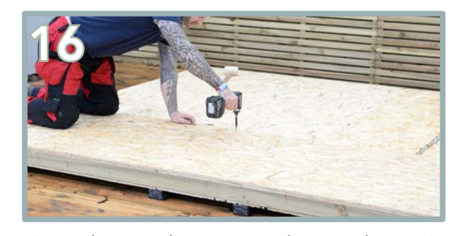
Screw the central screws into place, resulting in 3 in a row. This will result in 15 x 35mm screws per OSB sheet.