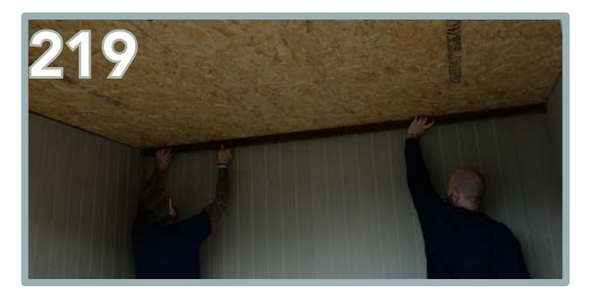
Apply the 45x45mm roof battens. Start at the back. Ensure it is flush end to end and against the back beaded panels. Secure with 5 x 80mm screws. Repeat the same process as the front.