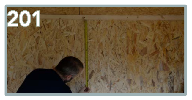
Measure and mark out even spaces to position the two middle battens.