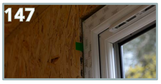
Insert packers underneath to level it and maintain the 5mm expansion gap. Ensure the back of the frame is in line with the OSB sheet inner face as shown above.