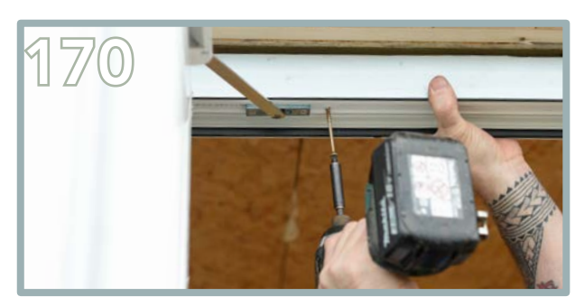
Repeat the process through the top. Drill 150mm from the both internal sides of the double doors. Use 112mm screws to screw through the top of the frame as shown above.