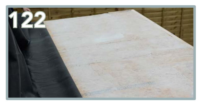
Apply glue to half of the roof and ensure to reach up to all of the edges.