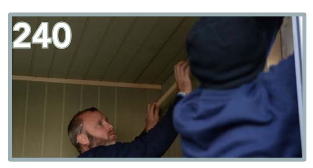
Apply the roof trims on each side, in between the front and back. Ensure these are flush end to end and follow the angle of the roof from front to back.