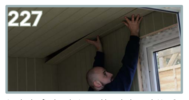
Apply the final and trimmed beaded panel. Use 8 x 50mm screws to secure.