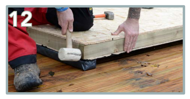
Insert and knock the floor capping (AL) into place using a rubber mallet. Ensure it is flush to all edges.