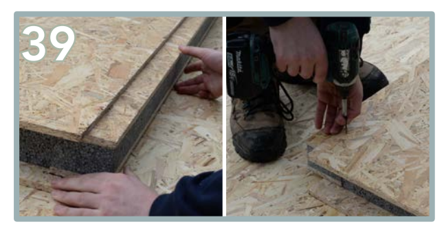
There will be smaller Spline panels (Q) that will be in between the grooves of some panels. Add expanding foam into each groove of the spline panel and apply them accordingly to the wall panel layout. Secure with 5 x 35mm screws.