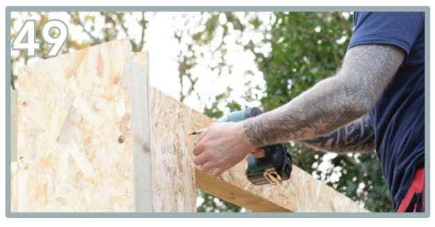
Position the screws on the wall panels OSB and screw into the window insert batten behind. Secure into place using 4 x 35mm screws internally and externally, 2 x 35mm screws each side of the window insert.