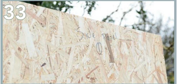
Next, start to build your walls. Each wall panel is labelled accordingly to the layout shown above and the components list at the back of this guide.