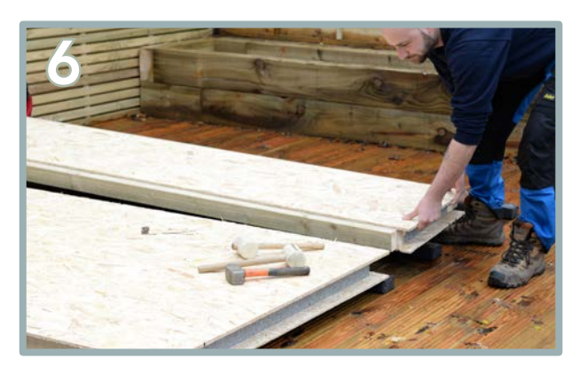
Place the second floor panel (A) onto the middle and end bearers. Ensure the panel is positioned half way on the middle bearer.