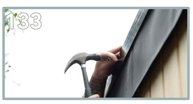
Use the pins provided with the plastic trims. Pin into the batten behind to secure in place.