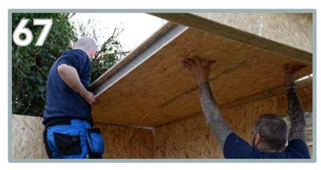
Lift up the first roof panel (V). Ensure at least 2 adults can lift up the roof panels carefully. Measure the overall width for the roof and allow 2mm each side in case of a slight oversize in roof panels.