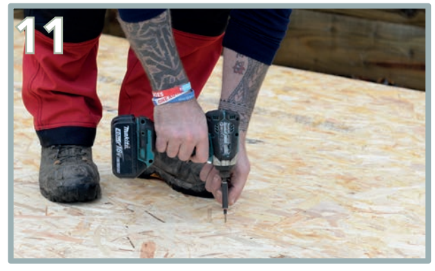
This step does not apply for the Xtend2.5 build. You only have 2 floors. Use the layout on step 12 as a guide.