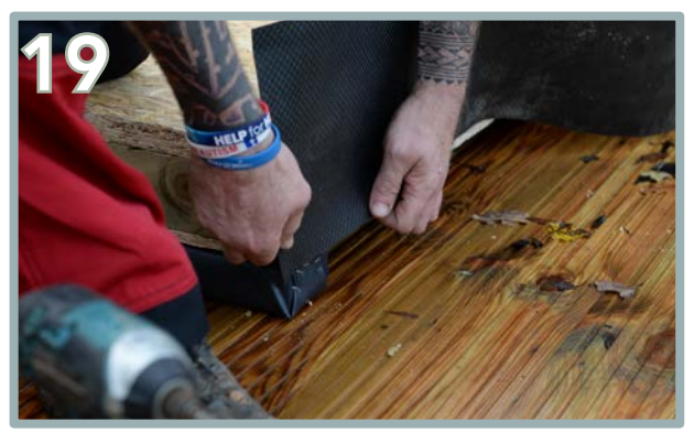
Start to unwrap the DPC roll and choose a starting point on the base's outer face. Ensure it covers half of the bearers and staple into place.