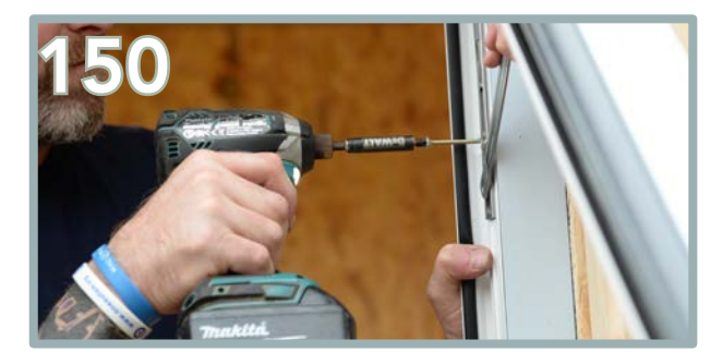
Fix the sides of the frame to the wall panels using the star head 112mm screws at the measurements marked out. Don't forget to fix the top and bottom of the frames.