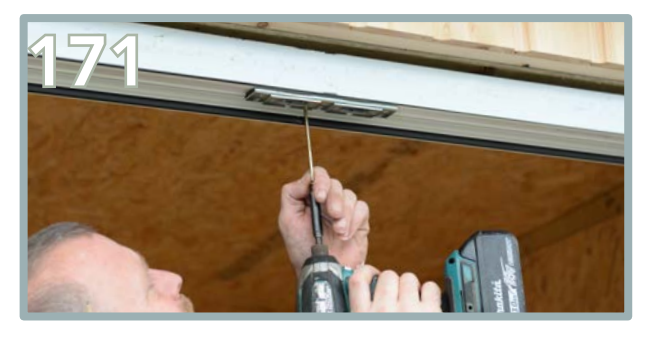
Repeat the same process centrally. Screw 1 x 112mm screw in the centre.