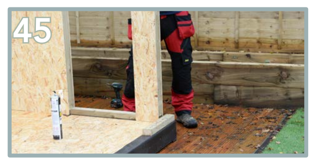
Apply the side wall panel (N1) as shown above, leaving the provided space for the window insert. This is labelled on the layout.