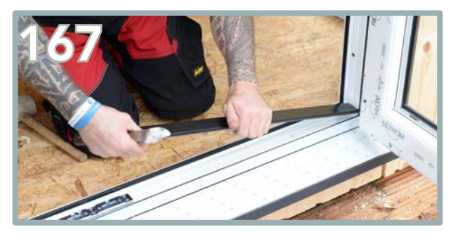
Remove the plastic strips from the bottom of the door frame. Keep hold of these pieces to re-apply afterwards.