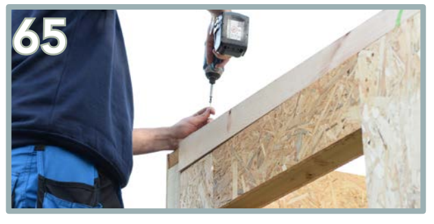
Use 2 x 125mm screws to secure the component within the thicker section.