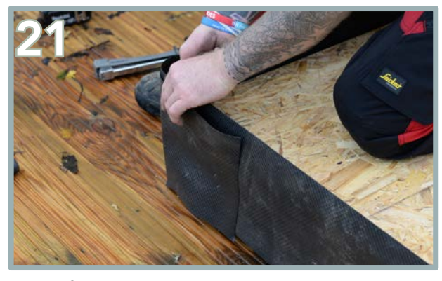
Once fully wrapped around the base, overlap the starting point and staple into place.