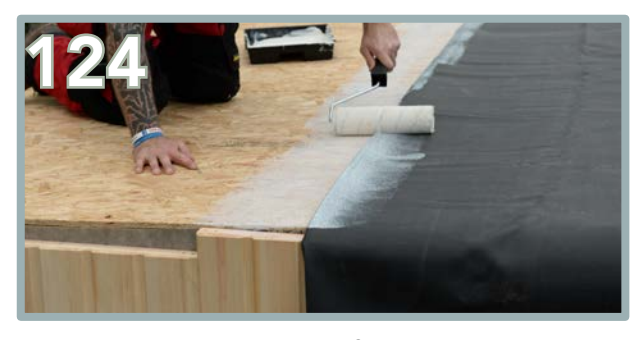
Repeat on the opposite half. Fold the EPDM back up until the point where the glue ended on the previous application.