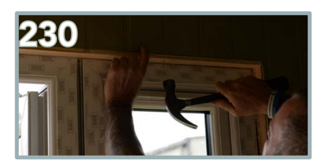
Nail into place using 6 x 30mm nails.