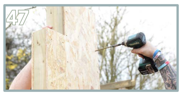
Position the screw roughly 45mm from the outer edge. Pre-drill and screw through the front into the side wall panel using 3 x 150mm screws (top, middle and bottom).