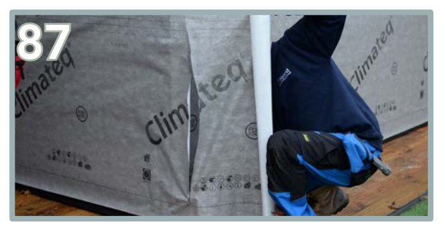
Once the starting point has been overlapped, cut off the excess and staple the end of the material into place.