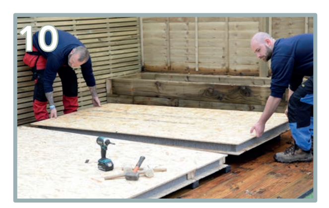
This step does not apply for the Xtend2.5 build. You only have 2 floors. Use the layout on step 12 as a guide.