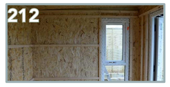
Use 4 x 80mm screws for each of the three smaller battens. You will apply the roof battens on after the beaded wall panels have been installed.