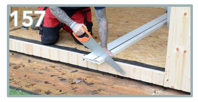
The door ledge will be oversized by 100mm. You will need to measure and cut off the excess.