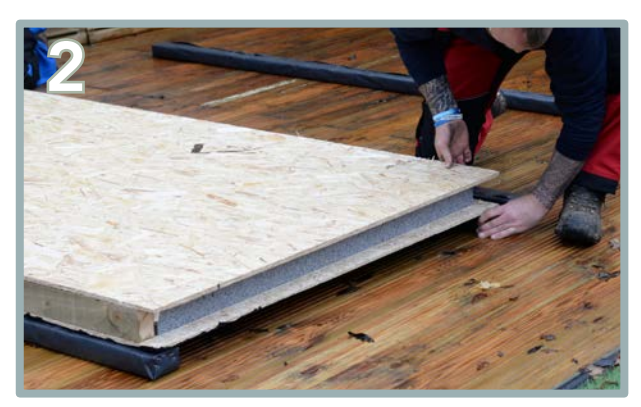
Place the first floor panel (B) on top of the two bearers and position it half way onto the second bearer. The black side covered in tar will be on top of the bearers as shown above.