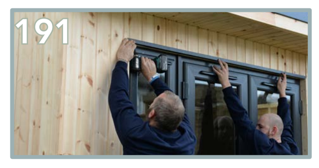
Position the top plastic 'L' strip across the door. Pre-drill the face underneath and fix first.