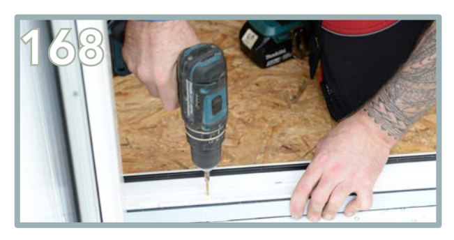
Drill 150mm from the both internal sides of the double doors. Use 112mm screws to screw into place at each side into the bottom of the frame as shown above.