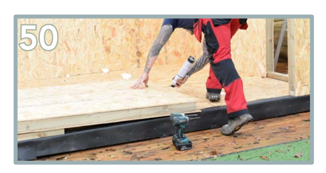
Apply the last left hand side panel (J). Apply expanding foam into the bottom groove.