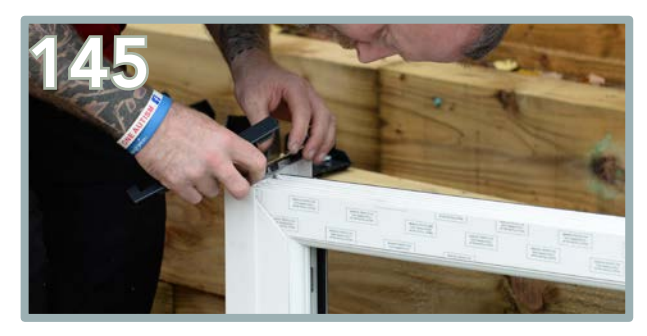
Be sure to seal the ends of sill with the caps provided to prevent moisture from tracking along into the wood work.