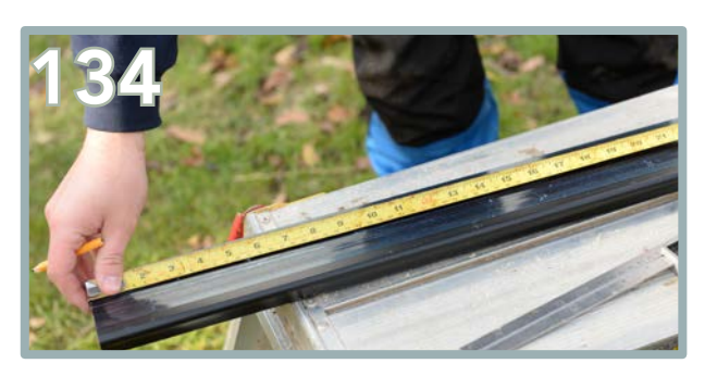
The other plastic trims will need to be measured out and cut using a hand saw to fit next to the fixed roof trim. Further detail will be shown throughout the application of the trims below.