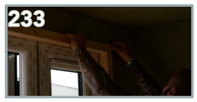
The top frame will sit on top of the side boards. Ensure both ends are flush to the side framing edge. Trim if necessary.