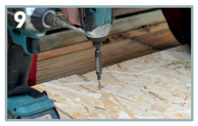
Using 4 x 35mm screws, pre-drill and screw where the adjoining panels intersect. This will secure the floor panels together.