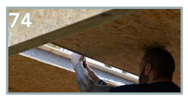
Lift up the second roof panel (U) and apply expanding foam into the inner groove as shown above.