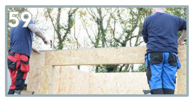
Insert the front wall plate (AL), knocking into place. Expect this to be tight fitting. Ensure it is flush to the top and ends.