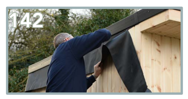
Once the plastic trims are complete around the roof, using a Stanley knife remove all of the EPDM excess. Use the plastic trims as a guide. Be careful not to cut the T&G panels behind.