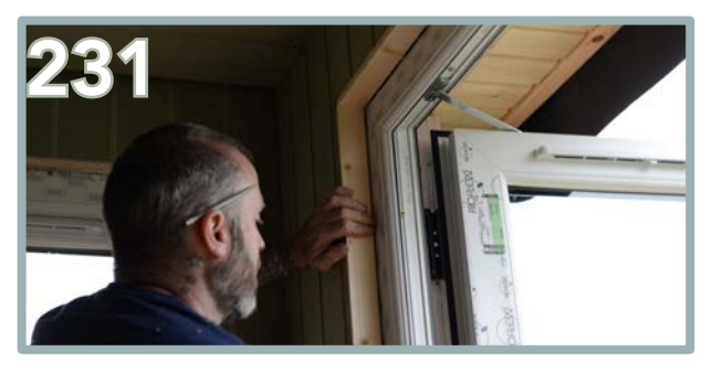
Apply the internal sides on either side of the door. Trim to fit if necessary. Use 5 x 60mm nails for each board to secure.