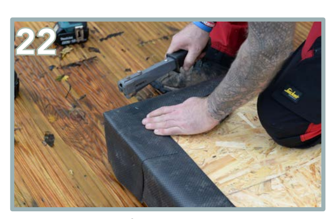
Using a Stanley knife, cut the DPC at the corner to create 2 pieces to easily fold onto the OSB sheets and staple into place.