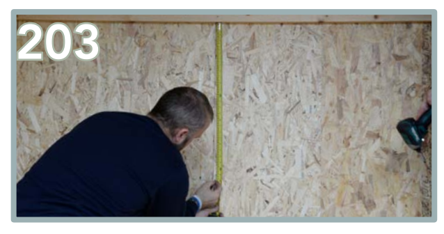
Repeat the same process to measure and mark out the position for the final back batten.