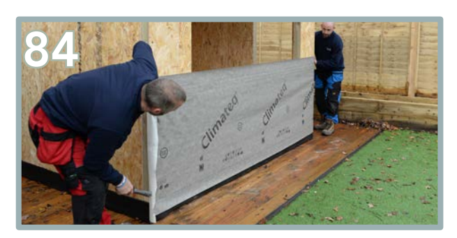
Starting with the bottom section, pull the membrane tightly and staple into place.