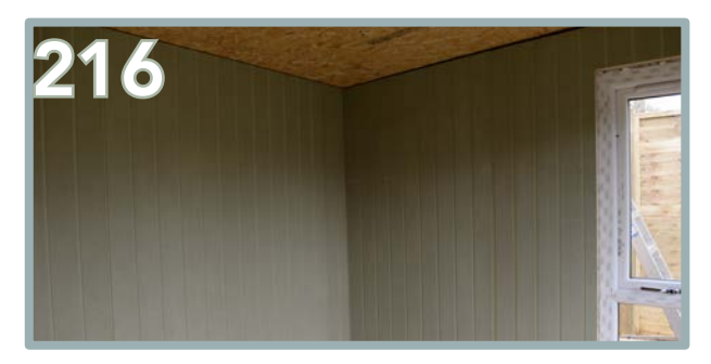
On the side panels, work from the front to the back. Ensure the window board is flush to the window edges. Then apply the next side piece. This is already trimmed for the provided space.