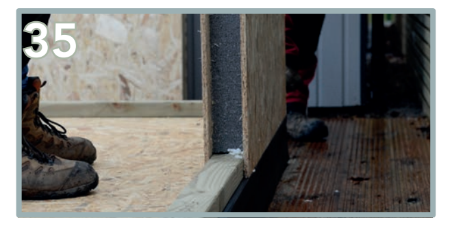
Place onto the floor plate and the wall panel will sit flush to the edge.