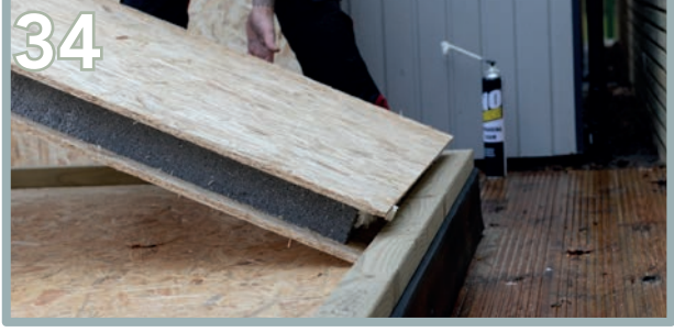
Begin the build at the left back corner, starting with Side Panel 2 (H). Insert the expanding foam provided into the bottom groove.