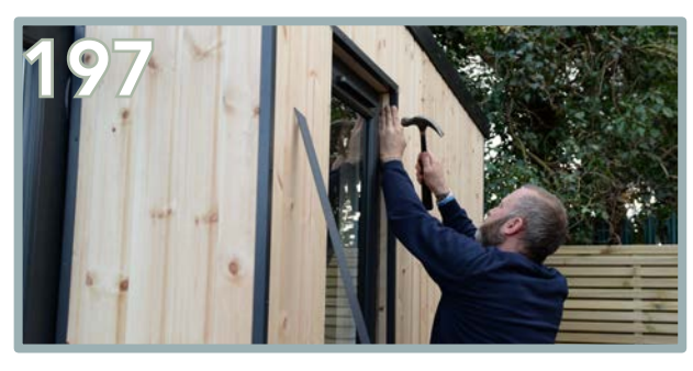
Pre-drill and use 5 x pins on the front of the side plastic trim. Repeat for the opposite side.