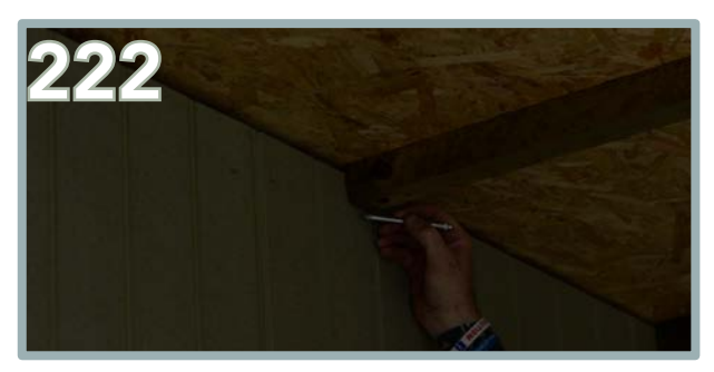
Mark out a guide line underneath all the battens at both ends. This will help when applying the roof panels and ensuring that you drill into the battens behind.