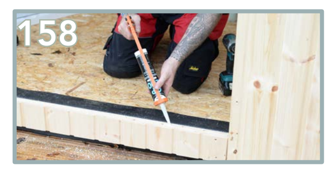
Apply the adhesive silicone in the door section. Be sure to seal the ends of sill and frame assembly to prevent moisture from tracking along the sill and into the wood work.