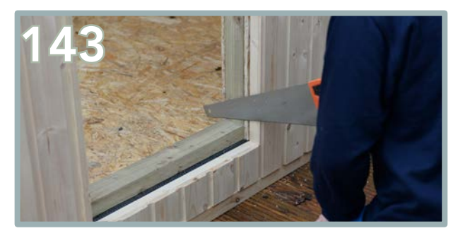
Remove the timber excess from the window section before inserting the window frame. Take out any screws in this section and cut with a saw, using the inner edge as a guide.