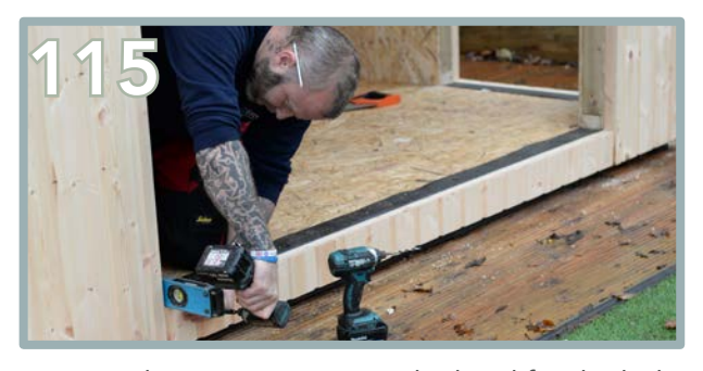
Repeat the same process as the lintel for the kick plate panel (BK) that goes underneath the door opening.