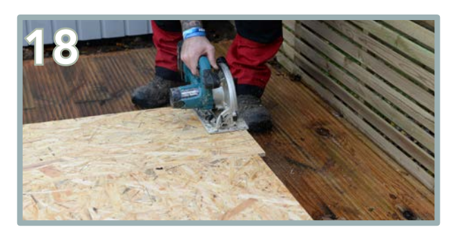
Some pieces may be oversized. If this is the case, saw the excess off after the piece is screwed into place, to create a flush finish.