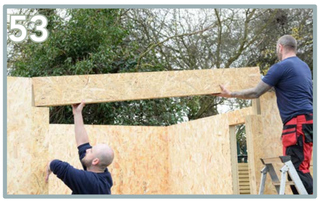
Insert the lintel piece (R) and knock into place. Ensure it is flush on the top.