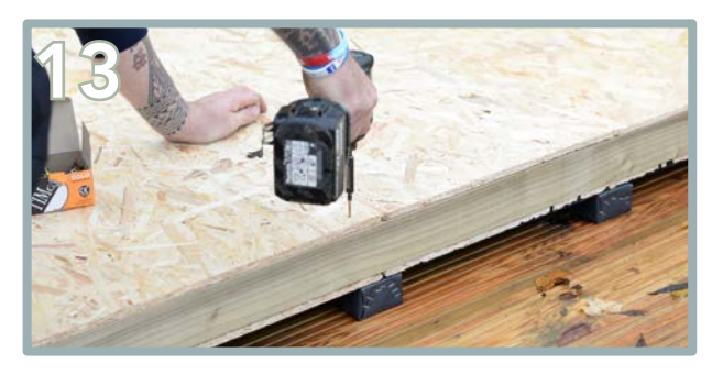
Pre-drill and use 4 x 125mm screws and ensure each screw goes into the bearer beneath. Screw 35mm screws in between the 125mm screws. Repeat process for the other floor capping.