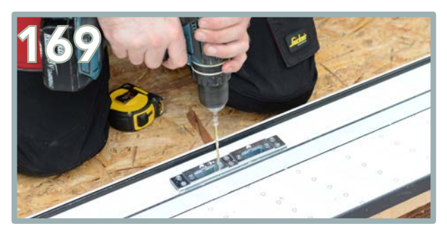
Then screw 1 x 112mm screw into the centre.