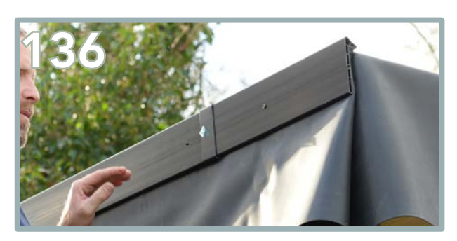
Use the clips provided to clip the pieces together. Repeat the same process on the opposite side.