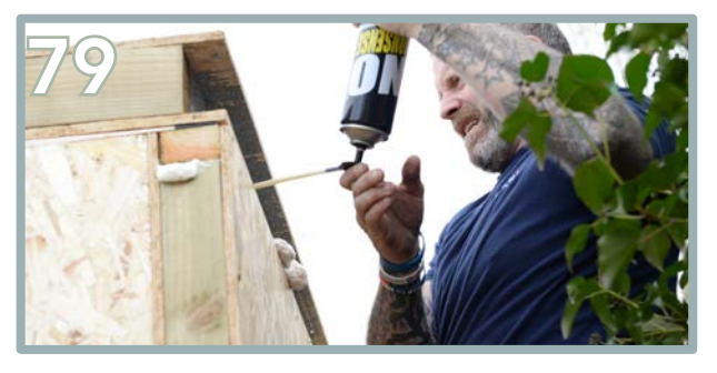
Use expanding foam in the roof panels groove across all 3 panels.