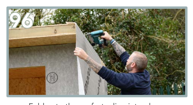
Fold onto the roof, stapling into place.