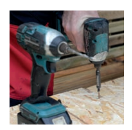
Drill & 2-6.5mm Drill Bits

We recommend using the following tools (not supplied):