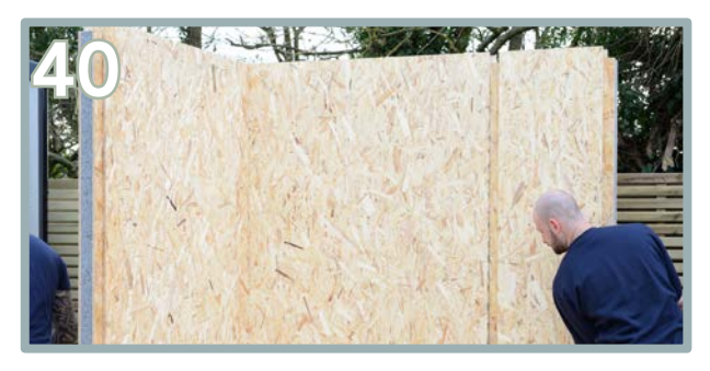
Slide the spline (Q) in the first panel (H). Please note that Xtend2.5 only has 2 x back panels.