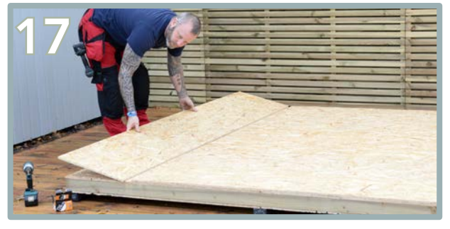
Ensure that all OSB sheets fit proportionally onto your floor.