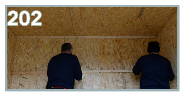
Use 5 x 80mm screws to secure equally across the batten in place.