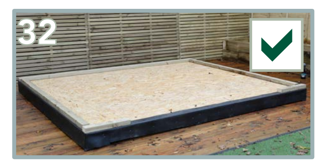
The final result is shown above.