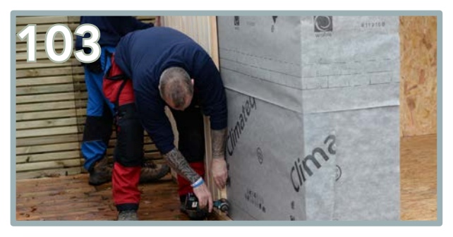
Continue onto the side panels (BB). Knock the first panel in place and ensure it is butted up against the back panel overhang.