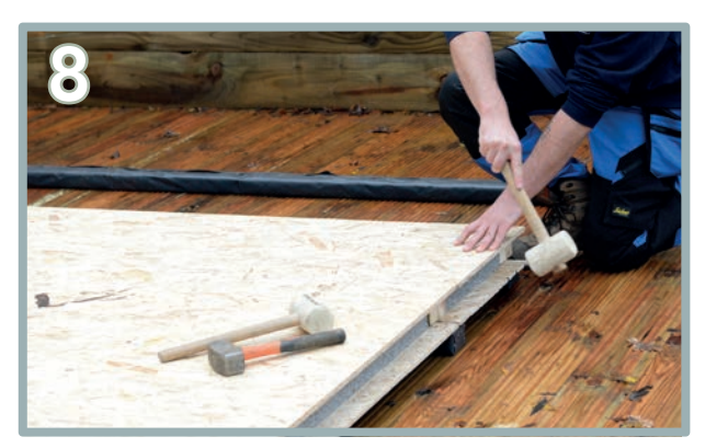
Knock on the front and back of the second panel to ensure it is flush on both edges to the first panel and floor bearers.